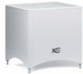
Santorin 17 subwoofer