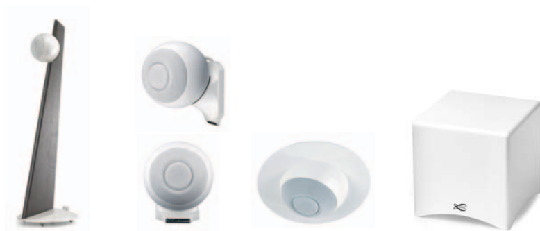
on stand on wall or on base in Ceiling SANTORIN 25 subwoofer

Able to deliver in stereo musical peaks over 122 dB SPL, iO2 can reproduce any type of music and sound at realistic levels with a fidelity in timbres and soundstage which has convinced numbers of audio & video professionals for stereo of multi-channel monitoring.