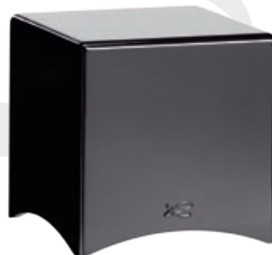
SANTORIN 21 SUBWOOFER