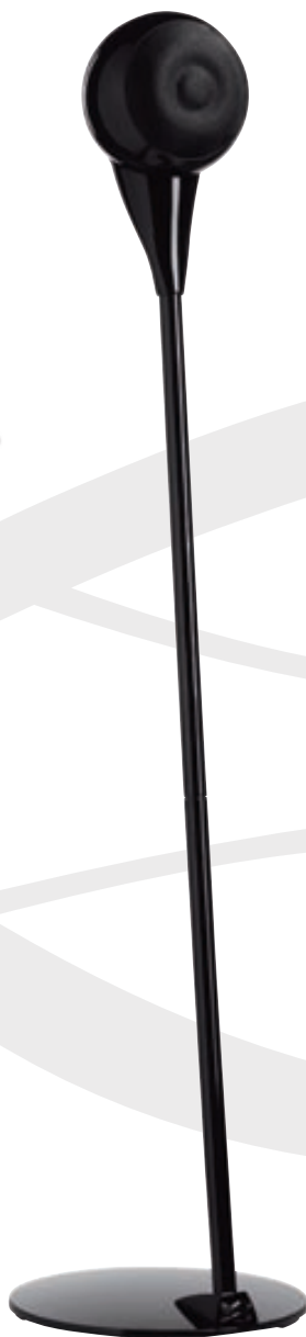
EOLE 2 FLOORSTANDING